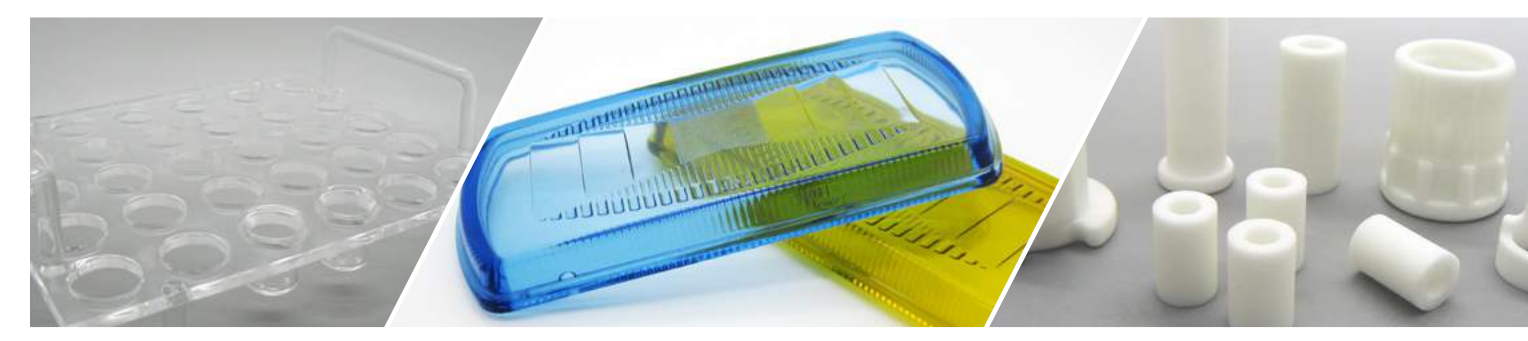
GLASS / COLORED GLASS / BLOWN GLASS / MOLDED GLASS / CERAMICS