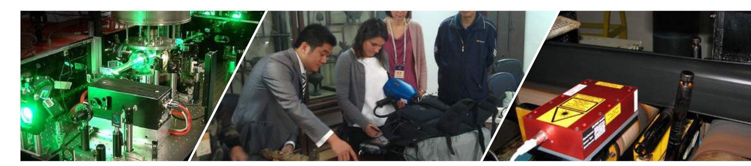
On site demonstration, training, installations and after sales support