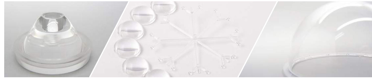
LED COLIMATORS / LENSES / MICRO-LENSES / TRANSPARENT COVES MATERIALS: PMMA / PC