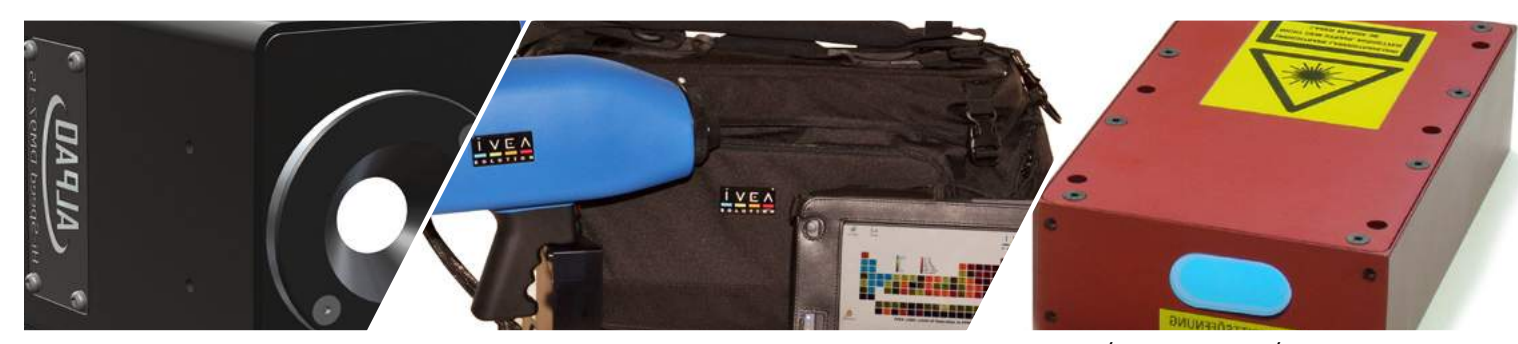
OPTICAL HIGH TECHNOLOGY EQUIPMENT DESIGNED FOR: MEASURING / ANALYZING / OBSERVING