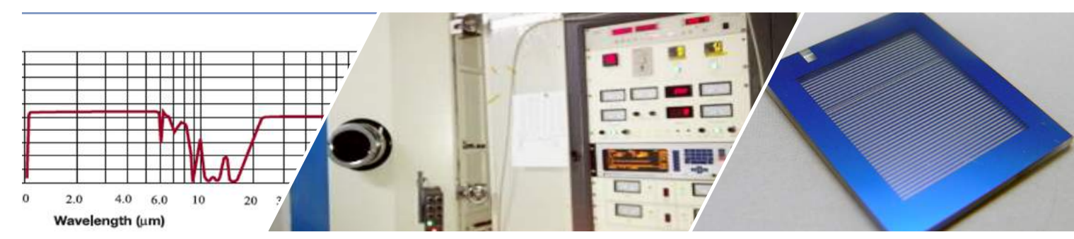
AR / MIRROR / BANDPASS / MULTI-BAND / BEAMSPLITTERS / MARKING & MASKS