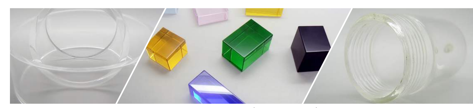
Tubes / Ornamental / All sorts of Glass machining